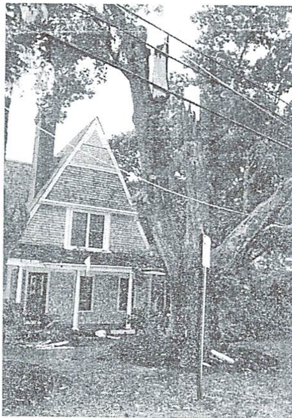
A tree down on Standish St. that caused a major inconvenience to residents. Electricity was also out for 4 hours.